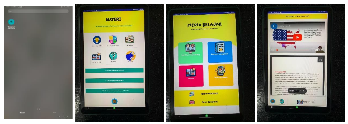
Figure 4. Interactive Multimedia Display Based on Android Accessible via Smartphone

This stage ensures that the developed product accurately meets the desired specifications and has been tested for effectiveness. The final product of the development process is presented below.