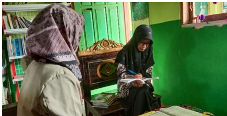
Figure 3. Documentation of an Interview with an Economics Teacher

It needs to be underlined that not all students like economics subjects (Susilo & Asmara, 2020).