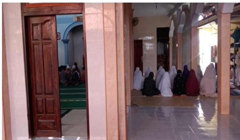
Figure 5. Documentation of Congregational Noon Prayer Activities

Based on the results of interviews with students of class XI MA Darul Ulum namely that the teacher has taught the values of character education in the economics learning process in the classroom and everyday life, such as responsibility, discipline, independence, honesty, and curiosity and students claim to easily understand the methods and methods carried out by the teacher in economics learning because the economics teacher apart from giving explanations in class the teacher also sends files or videos from the previous day that can be studied at home so that students quickly respond to the explanations that the teacher conveys. Moreover, with character education in class XI, it can make students learn to respect time, respect teachers, listen well, and of course, provide moral education so that they are not only good at the material but also have rules in behaviour so that character education can be applied in everyday life. Days both at school and outside school.