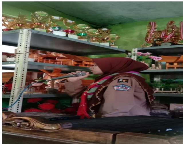
Figure 4. Documentation of Joint prayer activities

Based on the results of interviews with students of class XI MA Darul Ulum namely that the teacher has taught the values of character education in the economics learning process in the classroom and everyday life, such as responsibility, discipline, independence, honesty, and curiosity and students claim to easily understand the methods and methods carried out by the teacher in economics learning because the economics teacher apart from giving explanations in class the teacher also sends files or videos from the previous day that can be studied at home so that students quickly respond to the explanations that the teacher conveys. Moreover, with character education in class XI, it can make students learn to respect time, respect teachers, listen well, and of course, provide moral education so that they are not only good at the material but also have rules in behaviour so that character education can be applied in everyday life. Days both at school and outside school.