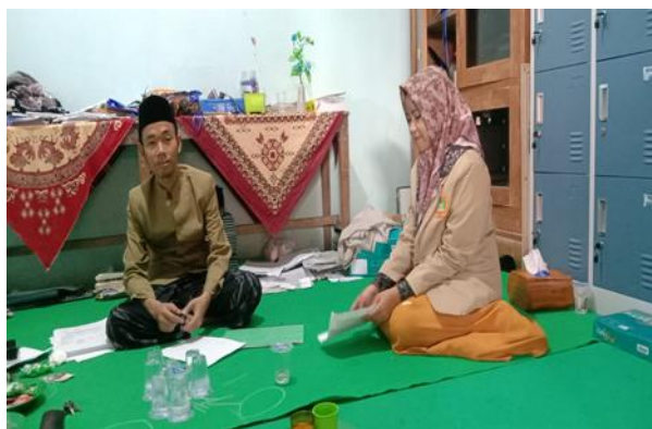
Figure 2. Documentation During an Interview with the School Principal

teachers have carrying out their duties and responsibilities very well, it's just that the teachers lack the support or participation of parents of students, which parents should also be overly concerned about or take part in supervising the education of children at school, but here parents just give up, and parents of most students only visiting schools once every three years and regarding habituation of students in character building, namely having to repeat it every year or every time because when it comes to habituation, every year there must be a change in student habituation, and every year there must be a change of students if for now the habituation starts from prayer readings before entering school are followed by duha prayers, congregational noon prayers, and greenery such as planting chilies, flowers and so on. So that the instilling of student character can run continuously both at school and outside of school, the Principal, apart from providing character cultivation in all subjects, also gives a warning to students when doing things that are violated, such as for students who bring mobile phones to school then the teacher will confiscate the mobile phone, and give a squat jump sanction for those who are not disciplined, and if outside the school then the teacher will give a direct warning where they must maintain the good name of the school institution and may not use the school met in matters outside school if they cannot maintain a good name school".