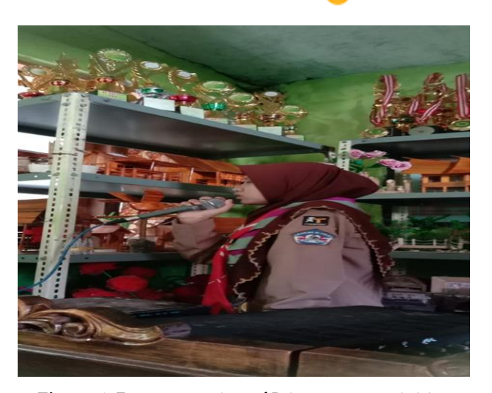
Figure 4. Documentation of Joint prayer activities

Based on the results of interviews with students of class XI MA Darul Ulum namely that the teacher has taught the values of character education in the economics learning process in the classroom and everyday life, such as responsibility, discipline, independence, honesty, and curiosity and students claim to easily understand the methods and methods carried out by the teacher in economics learning because the economics teacher apart from giving explanations in class the teacher also sends files or videos from the previous day that can be studied at home so that students quickly respond to the explanations that the teacher conveys. Moreover, with character education in class XI, it can make students learn to respect time, respect teachers, listen well, and of course, provide moral education so that they are not only good at the material but also have rules in behaviour so that character education can be applied in everyday life. Days both at school and outside school.