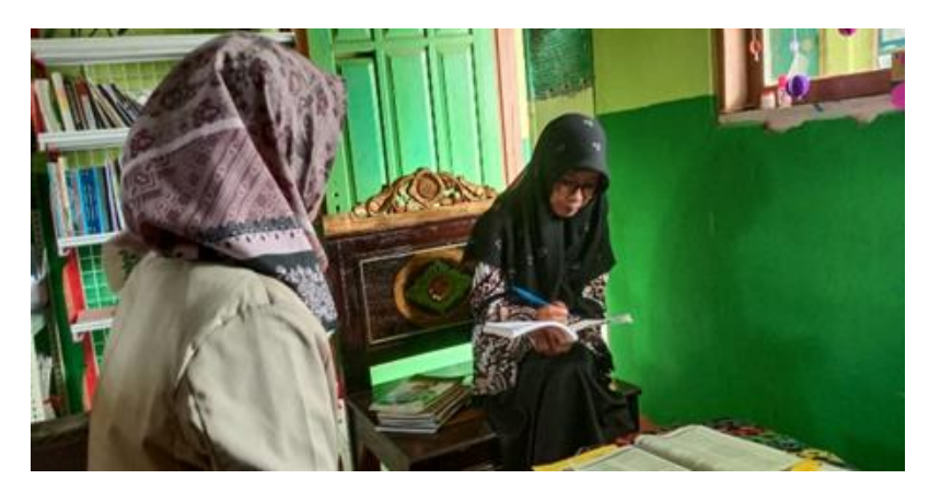
Figure 3. Documentation of an Interview with an Economics Teacher

It needs to be underlined that not all students like economics subjects (Susilo & Asmara, 2020).