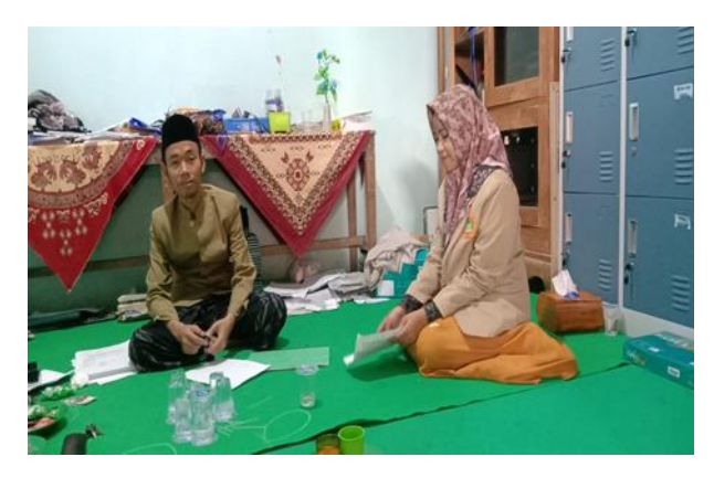
Figure 2. Documentation During an Interview with the School Principal

teachers have carrying out their duties and responsibilities very well, it's just that the teachers lack the support or participation of parents of students, which parents should also be overly concerned about or take part in supervising the education of children at school, but here parents just give up, and parents of most students only visiting schools once every three years and regarding habituation of students in character building, namely having to repeat it every year or every time because when it comes to habituation, every year there must be a change in student habituation, and every year there must be a change of students if for now the habituation starts from prayer readings before entering school are followed by duha prayers, congregational noon prayers, and greenery such as planting chilies, flowers and so on. So that the instilling of student character can run continuously both at school and outside of school, the Principal, apart from providing character cultivation in all subjects, also gives a warning to students when doing things that are violated, such as for students who bring mobile phones to school then the teacher will confiscate the mobile phone, and give a squat jump sanction for those who are not disciplined, and if outside the school then the teacher will give a direct warning where they must maintain the good name of the school institution and may not use the school met in matters outside school if they cannot maintain a good name school".