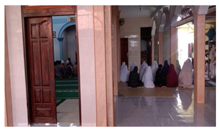
Figure 5. Documentation of Congregational Noon Prayer Activities

Based on the results of interviews with students of class XI MA Darul Ulum namely that the teacher has taught the values of character education in the economics learning process in the classroom and everyday life, such as responsibility, discipline, independence, honesty, and curiosity and students claim to easily understand the methods and methods carried out by the teacher in economics learning because the economics teacher apart from giving explanations in class the teacher also sends files or videos from the previous day that can be studied at home so that students quickly respond to the explanations that the teacher conveys. Moreover, with character education in class XI, it can make students learn to respect time, respect teachers, listen well, and of course, provide moral education so that they are not only good at the material but also have rules in behaviour so that character education can be applied in everyday life. Days both at school and outside school.