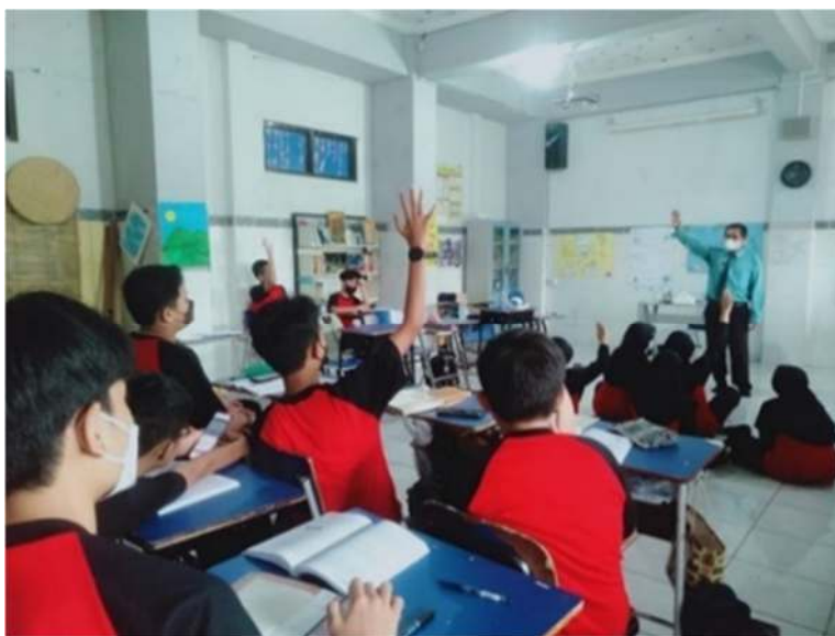
Figure 6. Question and Answer Session

Figure 6 is a question-and-answer session where students are very active in answering the questions raised by the teacher. The activeness of students in the class seemed to have mastered and understood the material because previously, the material had been studied first by students at home. After that, the teacher explains and explores the material that has been distributed. Then students try to analyze the material again in the form of a mind map given by the teacher. So that the creation of effective and efficient learning.