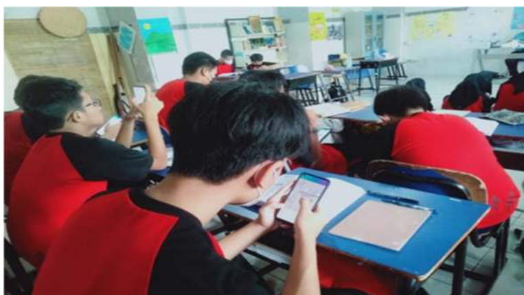
Figure 3. Making Mind Mapping

Figure 3 above is a learning process carried out by SMP Muhammadiyah 1 Sidoarjo in utilizing learning media in the form of the Canva application in making mind maps. Teachers use the flipped classroom learning model in the SMP Muhammadiyah 1 Sidoarjo PAI learning process. The flipped classroom learning model allows students to learn the material, especially at home. After students understand material already studied at home. Activity next inside class is assignment for measure understanding of such students complete and analyze the mind mapping given by the teacher with material "Faith to Messenger of Allah". After That, the result of the mind mapping designed on the application canvas will be presented by students in the front class in picture 3 below this.