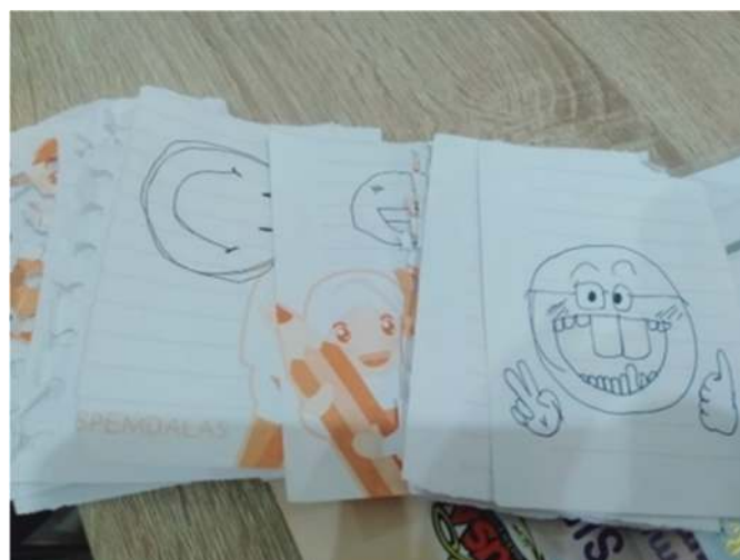
Figure 7. Student Feedback

Figure 6 is a question-and-answer session where students are very active in answering the questions raised by the teacher. The activeness of students in the class seemed to have mastered and understood the material because previously, the material had been studied first by students at home. After that, the teacher explains and explores the material that has been distributed. Then students try to analyze the material again in the form of a mind map given by the teacher. So that the creation of effective and efficient learning.