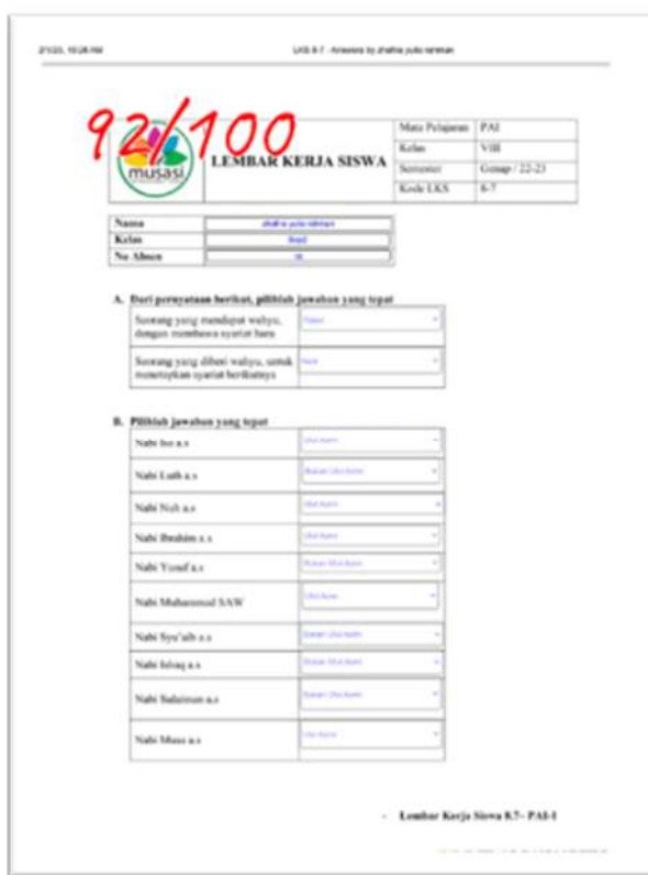
Figure 5. Student Worksheet (Worksheet)

Figure 5 above is the result of class VIII students' worksheets at SMP Muhammadiyah 1 Sidoarjo using the worksheet application. The use of worksheet applications takes advantage of digital-based learning, such as making worksheets used by teachers in evaluating learning. Using learning media in the worksheet application can increase student learning interest in answering several questions related to the material studied in class so that students do not feel bored while working. Student learning interest in using worksheet applications can increase student learning outcomes in the current era of digitalization (Wedyastuti, 2022).