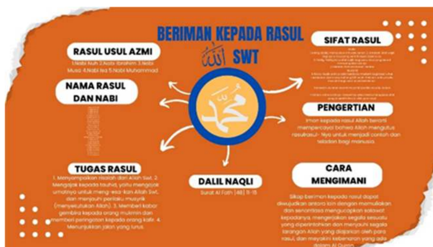
Figure 4. Results of Student Design

Figure 4 shows student design on the application canvas in making mind maps. Students can develop mark cognitive and creativity values on students. Cognitive value C1- C6 like Remember (C1) Understand (C2) Apply (C3) Analyze (C4) Assess (C5) Create. has the goal of seeing student feedback so that students can understand digital technology-based learning material and helps students in increasing cognitive values C1-C6 namely Remembering (C1) Understanding (C2) Applying (C3) Analyzing (C4) Assessing (C5) Create.