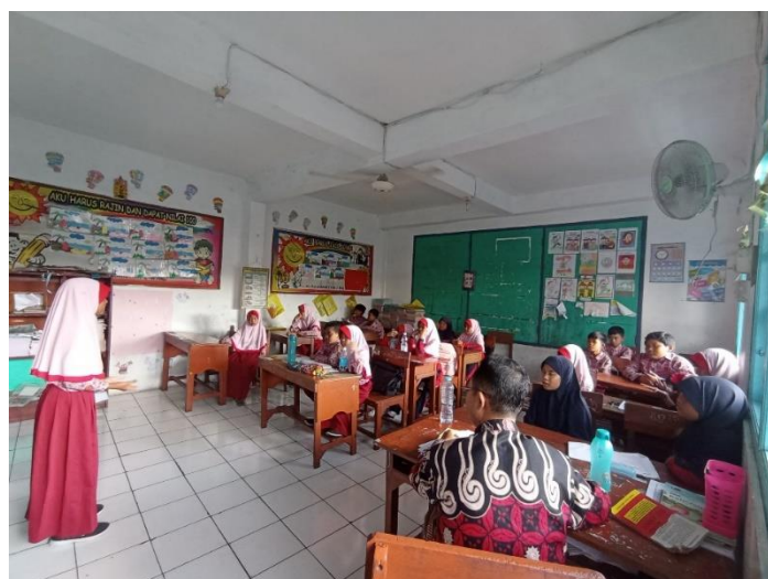
Figure 2. Da'i Cilik Extracurricular Activities

Little Da'i extracurricular activities at SD Muhammadiyah 2 Waru are conducted once a week, specifically on Wednesdays from 13:30 to 14:30. Students from grades 1 to 6 participate in this extracurricular activity.