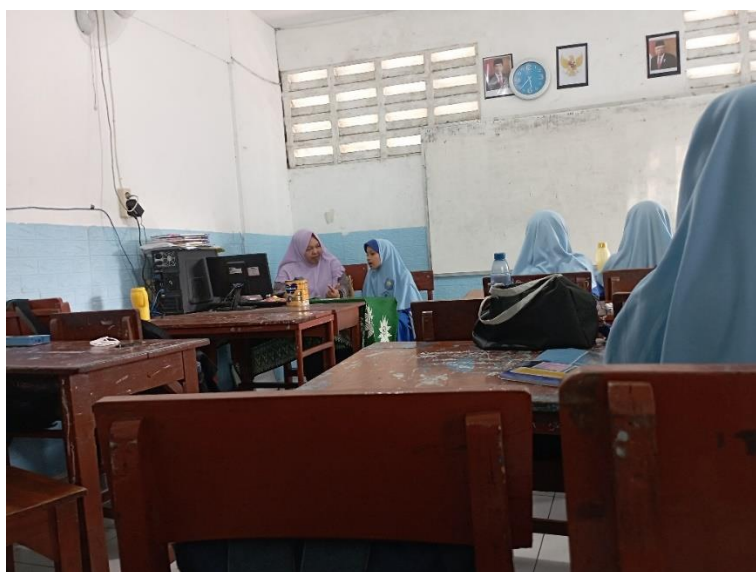
Figure 3. BTQ Extracurricular Activities

BTQ extracurricular activities at SD Muhammadiyah 2 Waru are conducted once a week, specifically on Mondays from 13:30 to 14:30. This extracurricular activity is open to students from grades 1 to 6.