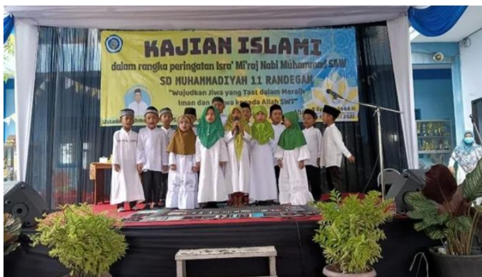
Figure 3. Activities to Commemorate the Religious Holiday of Isra' Mi'raj

Activities to commemorate religious holidays commemorate special days that occur in Islamic history. In the activities of commemorating religious holidays carried out by all school residents, especially in class IV students, where in this activity a recitation will be held, which will be attended by all school residents of SD Muhammadiyah 11 Randegan and a series of activities themed on Islamic religion, such as competitions Tahfidz Al-Qur'an, Speeches, Lectures, and others. Therefore, through this activity, it is hoped that it can foster a religious character towards students to become brave Manuia and continue to follow activities by the teachings of Islam.