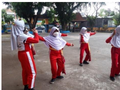
Figure 1. Tutors Help Students

raised to form an oblique downward position. Head position and look straight ahead. At the fourth meeting, students learn the pendulum movement. This movement begins with a straight leg stance, then one hand is straight to the side, and the other forms an L stance towards the vertical. In this meeting, the tutor helps students who have difficulty practicing the movements. Here is a picture of the tutor helping other students: