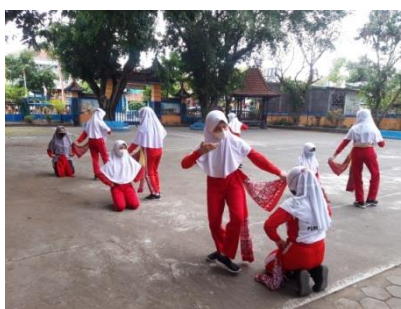
Figure 2. Aspects of Cohesiveness in Groups

In the third meeting, students repeat the movements they have learned and observe the accuracy of motion and counting in dance practice. Students in learning the accuracy of motion and counting are encouraged to observe the rhythm and count the beats by speaking. In the fourth meeting, students pair up, then the teacher prepares media in the form of videos. Students pay attention to tutors and videos in practicing dance moves. Tutors assist students in managing cohesiveness and student expression. At each meeting, students who have been appointed as tutors in cycle 1 provide examples and help other participants. The following is an example of the documentation in Figure 2.