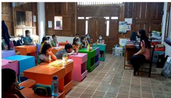
Figure 2. Meditation Activities

The results of the interview were also strengthened by the results of observations made by the researcher. Researchers found that children who adhere to meditation will participate more regularly in the learning process in class. This is shown by the child's attitude, which tends to be calmer than that of his other friends during the learning process. When the teacher is explaining material or someone else is talking in front of the class, the child will sit quietly while listening and paying attention to the person talking. In contrast, children who do not adhere to meditation will be less enthusiastic about learning, unable to concentrate or focus on learning, always distracted by situations and conditions outside the classroom, less responsive when spoken to, unable to receive learning well, and tend to be anxious and want to go home immediately.