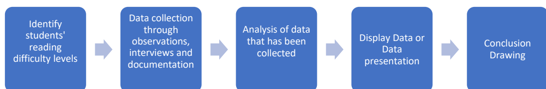
Figure 1. The Design of This Research Flow

Generally, qualitative research is carried out using data analysis techniques with models developed by Miles and Huberman, and the data analysis model is often referred to as the attractive analysis method. Miles and Huberman explained that the activities carried out in analyzing qualitative data were interactive and continued continuously until they found complete results. The steps taken in data analysis based on the data analysis model developed by Miles and Huberman or the design of this research flow are as follows: