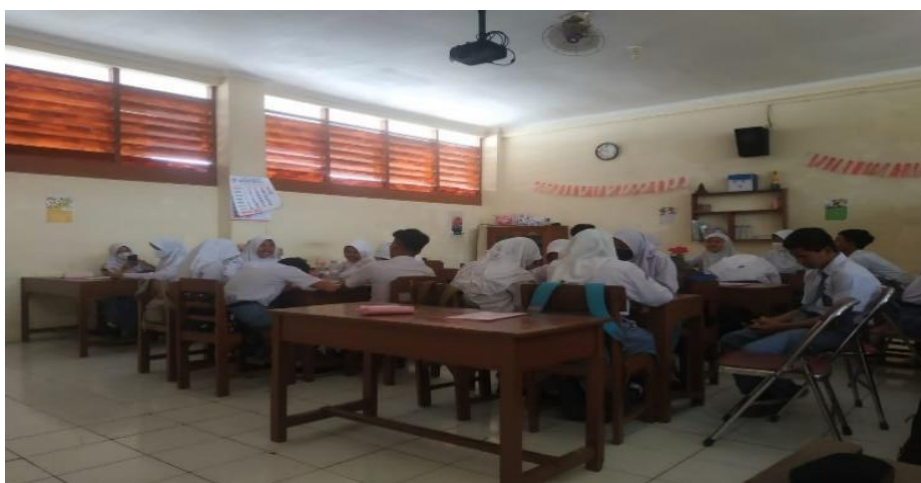
Figure 2. Student Groups Find Learning Materials to Develop Civic Responsibility Competencies

these tasks, the child will first be given a material framework so that the child's desire arises to explore the material independently. Students who are guided to work in groups can form a sense of responsibility in students. Group responsibilities can be seen in Figure 2.